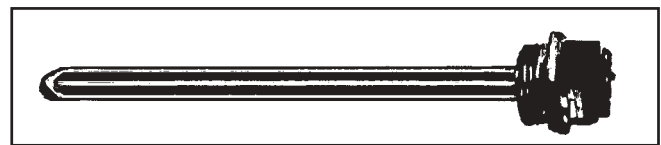
Screw Type Immersion Element